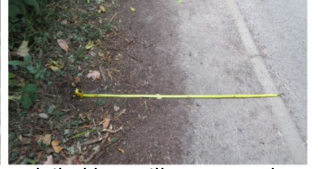
Flailed but still not enough

BC Highways have flailed and are to side-out the upper part. However, the hedge needs cutting back severely and in some places the edge digging out, followed by the footway widened to at least 1 metre and re-asphalted.